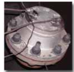
fig 1. - Test fixture

The test fixtures consisted of two, 6" 150 lb class, cast steel flange fixtures, constructed from raised face weld neck flanges. Both fixtures had an identical surface finish of 250 min and were superheated and supplied with water by a feed pump and pressure vessel. This configuration was meant to simulate a boiler feed system. The system was equipped with steam pressure regulator in order to control the feed water and maintain a stable steam pressure.